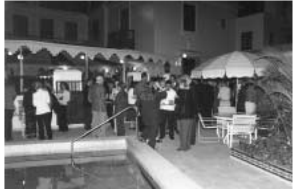
Reception at AGM